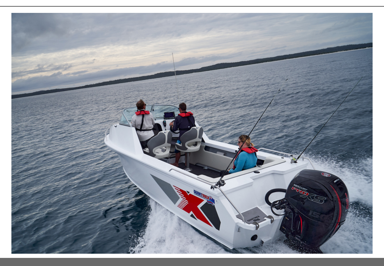
*ONLY ONE* Quintrex 590 Ocean Spirit + 3L 135hp Mercury 4S!!! Fully Optioned $83,990