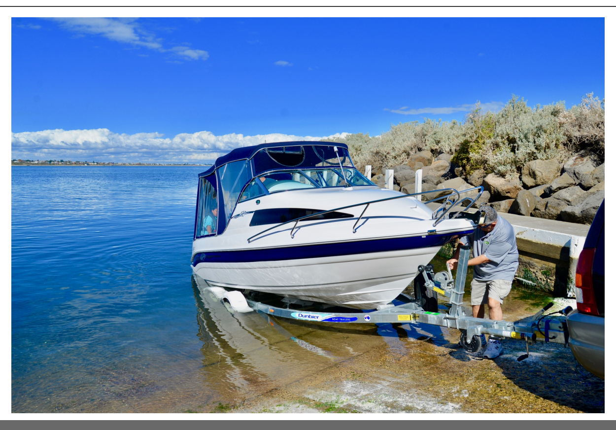
2024 Revival R590, Mercury 115hp 4 stroke, Dunbier Trailer $87,390