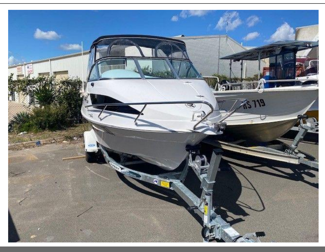
2024 Revival R530 Mercury 2.1L 90hp 4 stroke, Dunbier Trailer $59,550