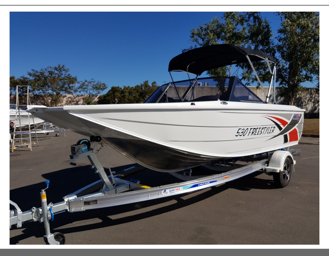
FI Alloy I-Beam Trailer **Extraordinary on water performance in a class of its ow $67,990.00