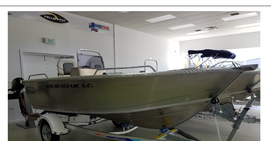
2024 Quintrex 420 Renegade Side Console Yamaha 50hp EFI Four Stroke $31,990.00